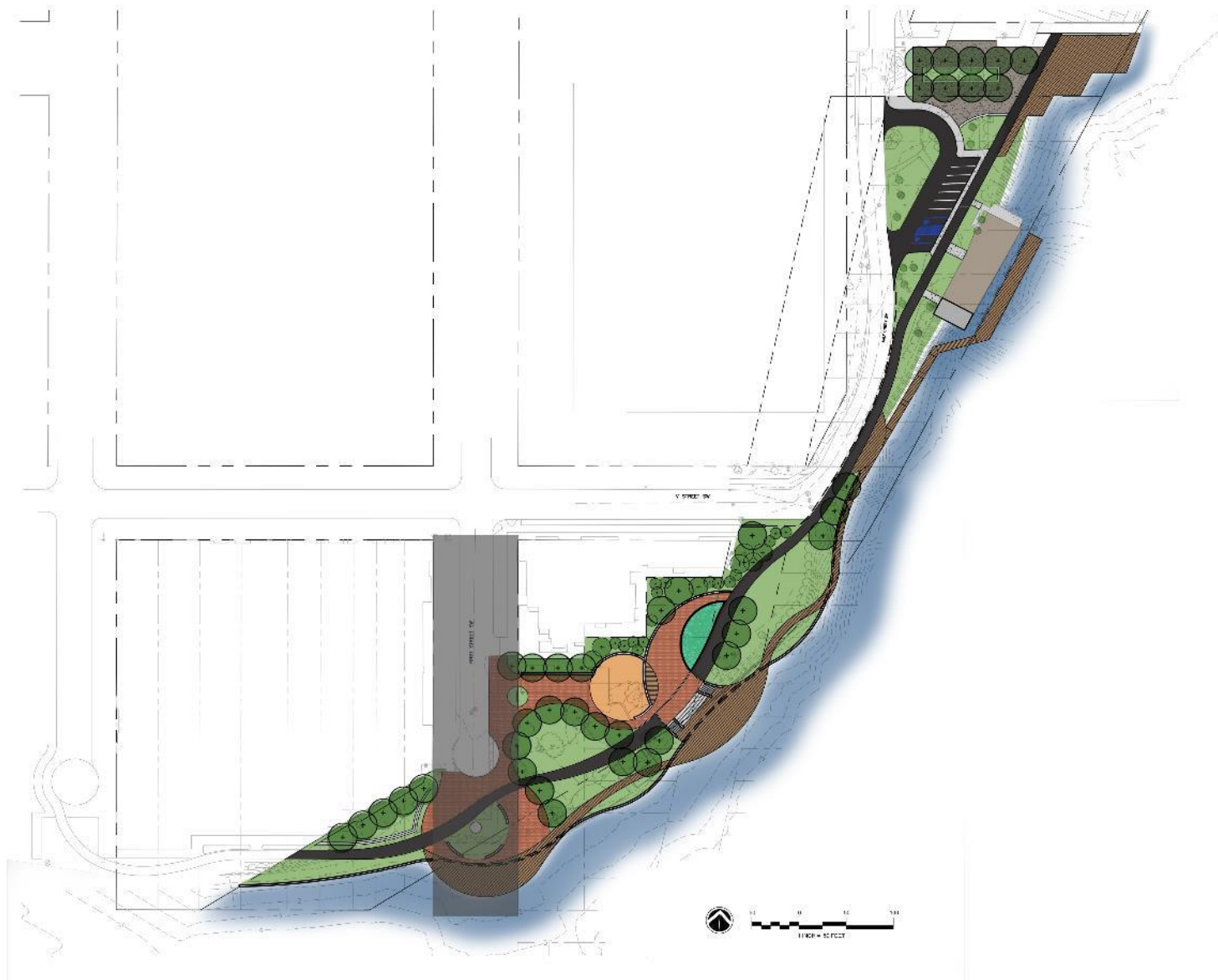
Alternative B-Option 2