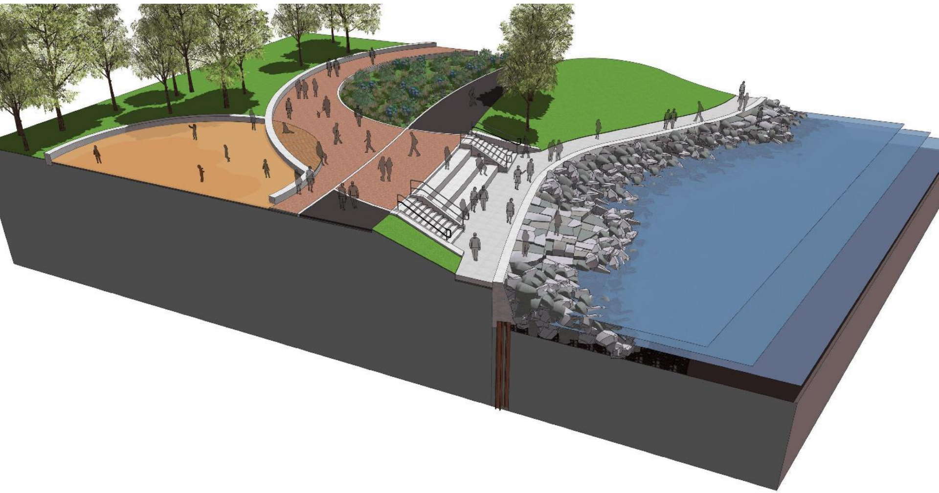
Alternative B-Option 1