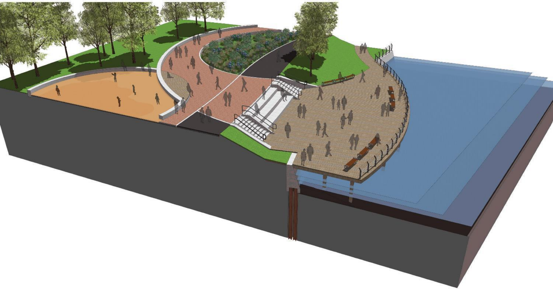
Alternative B-Option 2