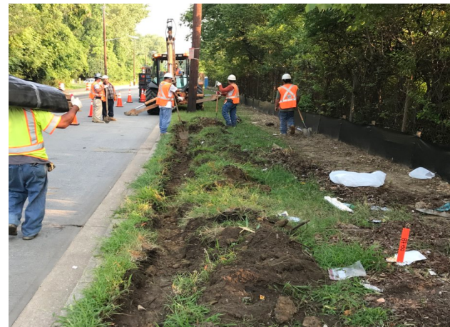
Work on the Brookland to Fort Totten section of the MBT is expected to be complete in May 2020