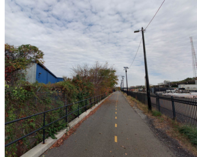
All lights on the existing MBT will be replaced by December 2019