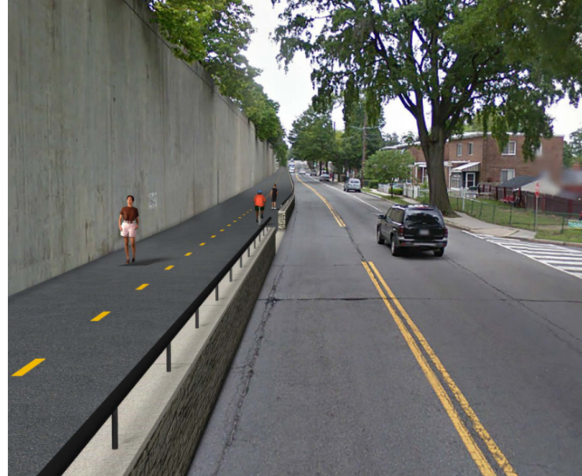
Rendering of the Metropolitan Branch Trail on Blair Rd at Whittier St in the Fort Totten to Takoma section.