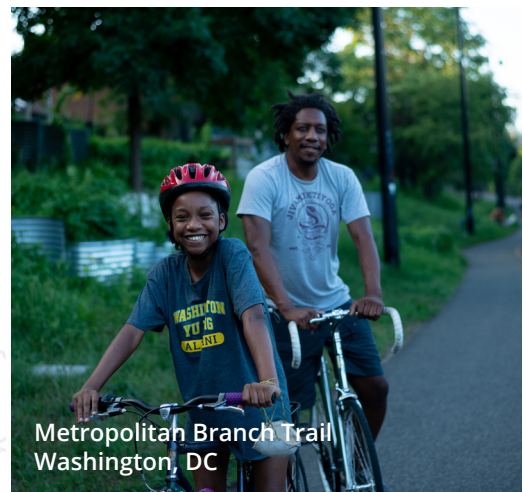
Metropolitan Branch Trail Washington, DC

The Capital Trails Coalition is a collaboration of public and private organizations, agencies, and volunteers working to advance completion of an interconnected network of multi-use trails for the Washington metropolitan area. Started in 2015, the Coalition has worked with each jurisdiction to identify planned trails that, once complete, will connect our region. The trails will be accessible to people of all ages and abilities, and will be developed and distributed equitably.