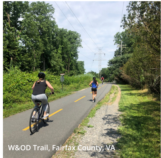
W&OD Trail, Fairfax County, VA

The Capital Trails Coalition is a collaboration of public and private organizations, agencies, and volunteers working to advance completion of an interconnected network of multi-use trails for the Washington metropolitan area. Started in 2015, the Coalition has worked with each jurisdiction to identify planned trails that, once complete, will connect our region. The trails will be accessible to people of all ages and abilities, and will be developed and distributed equitably.